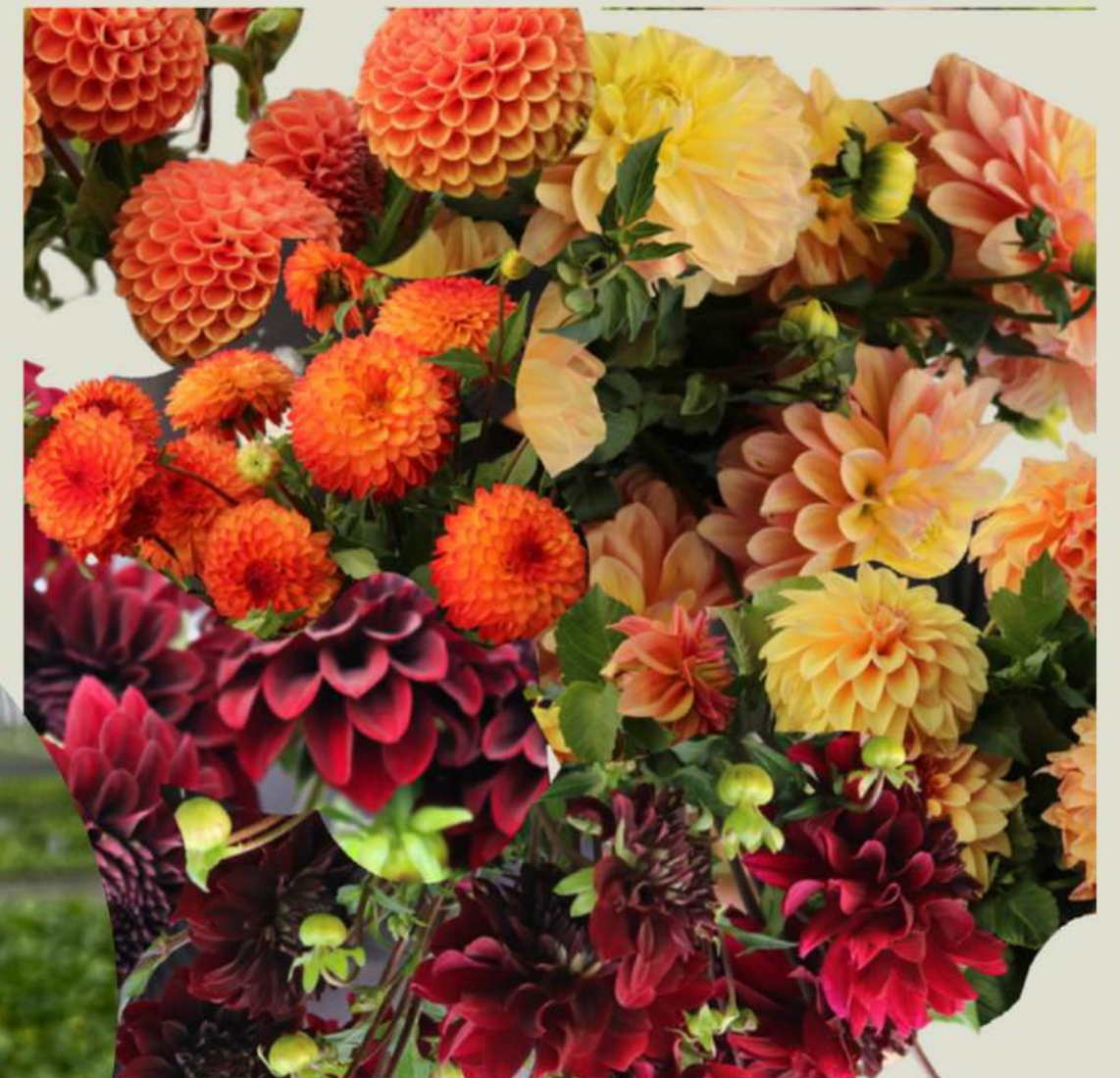
Fall Tone Mix

Includes: 5 strips orange tones 3 strips burgundy tones 2 strips yellow tones 1 strip = 4 plants Sampler includes 40 plants total