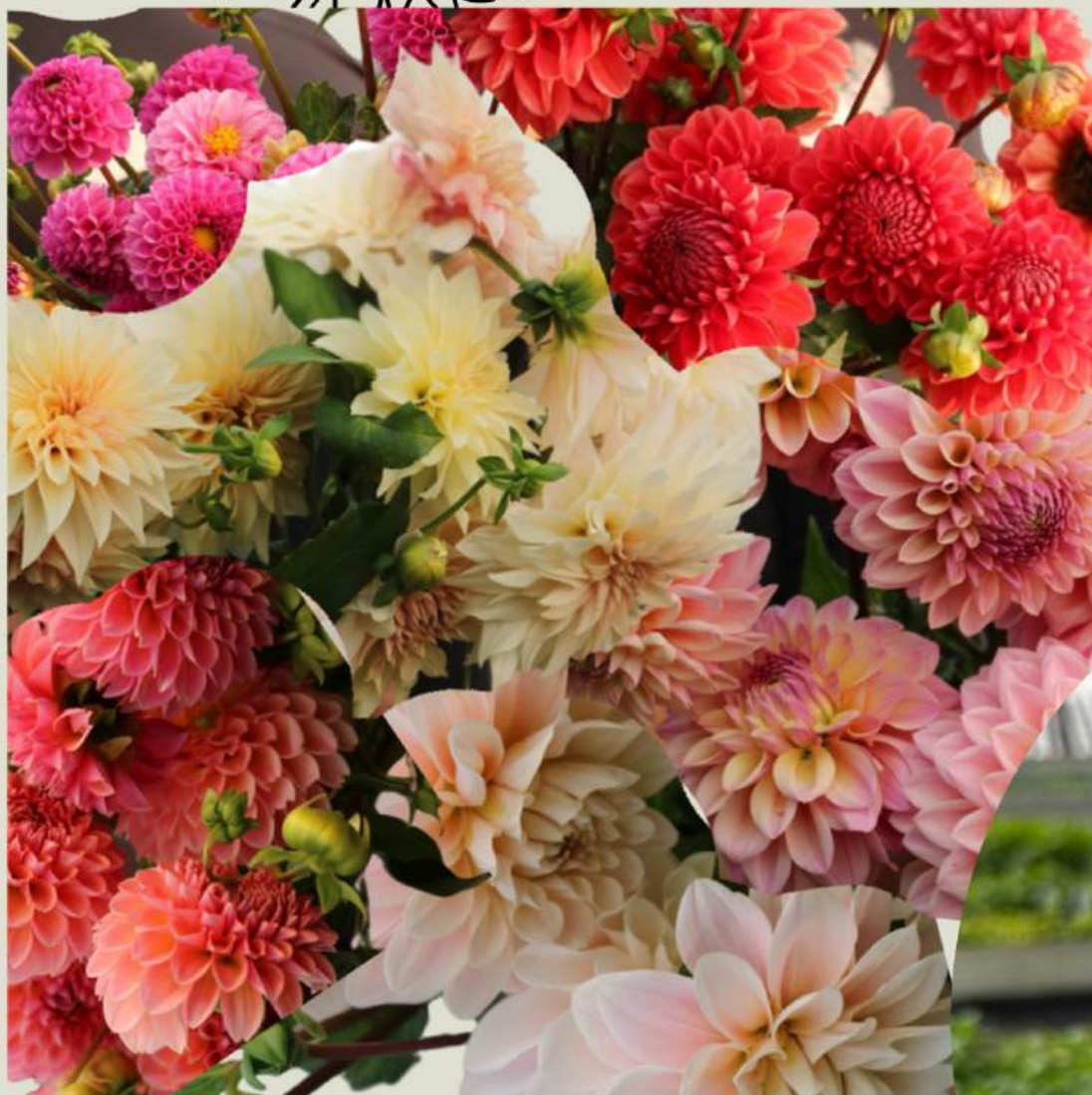
Summer Tone Mix

Pre-book Only with 3 week lead time - Shipping weeks 14, 16, 18, 20, 22